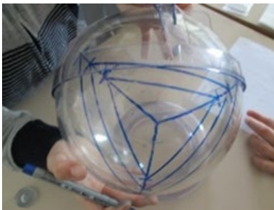
Figure 3. Spherical triangles

distance between two points. Secondly, the children observed “the terrestrial globe”, working to find the minimum path connecting two points on both maps and globes. The problem allowed them to compare the lengths of the paths, first evaluating them by eye, then devising simple tools and measuring systems. The concept of straight line and segment as “shortest path between two points” gradually matured, with different moments of comparison between conflicting opinions, verification, mutual conviction and discovery (See Figure 2 ).