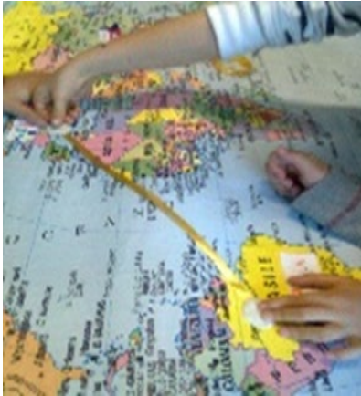
Figure 2. Measuring distances on a planisphere